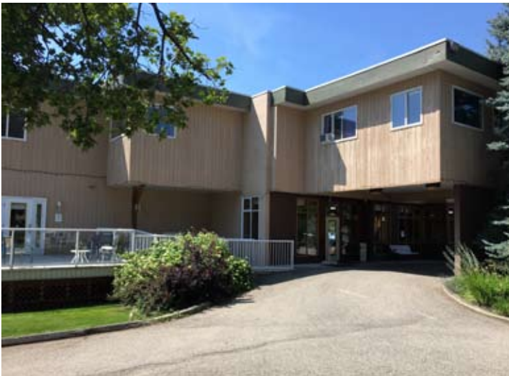
Above: Building entrance

The statements contained herein are based upon information furnished by the vendor and sources deemed reliable – for which we assume no responsibility, but which we believe to be correct. This submission is made subject to prior sale, a change in offering terms, or withdrawal from the market without notice. Purchasers should not construe this information as legal or tax advice and further suggest that consultation is made with their counsel, accountant or other advisors on matters related to this presentation.