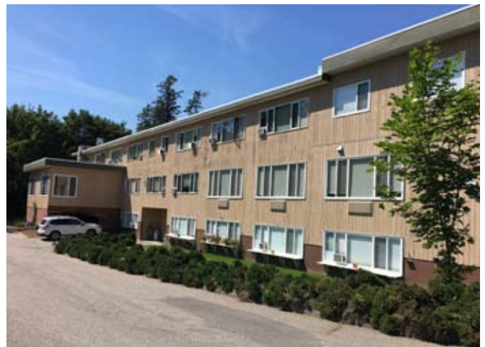
Below: Rear of building